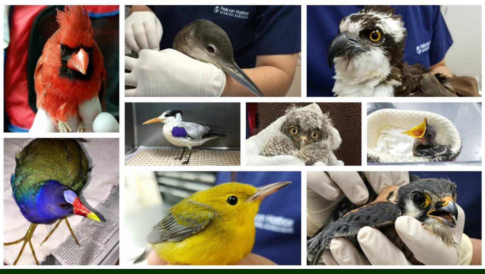
Mission : Pelican Harbor Seabird Station is dedicated to the rescue, rehabilitation and release of sick, injured or orphaned brown pelicans, seabirds and other native wildlife; and the preservation and protection of these species through educational and scientific means.