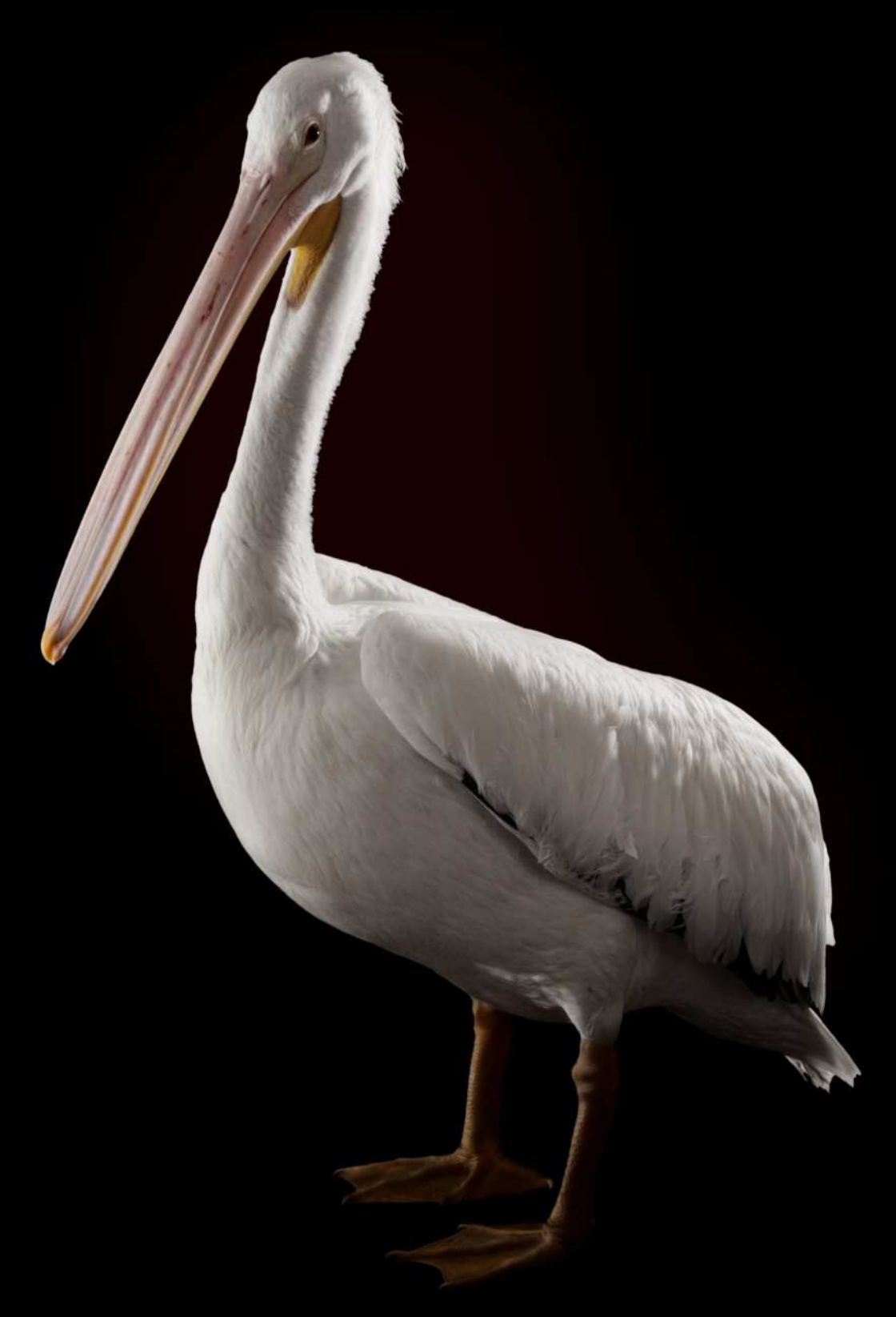
Pelican Harbor Seabird Station 2016 Annual Report