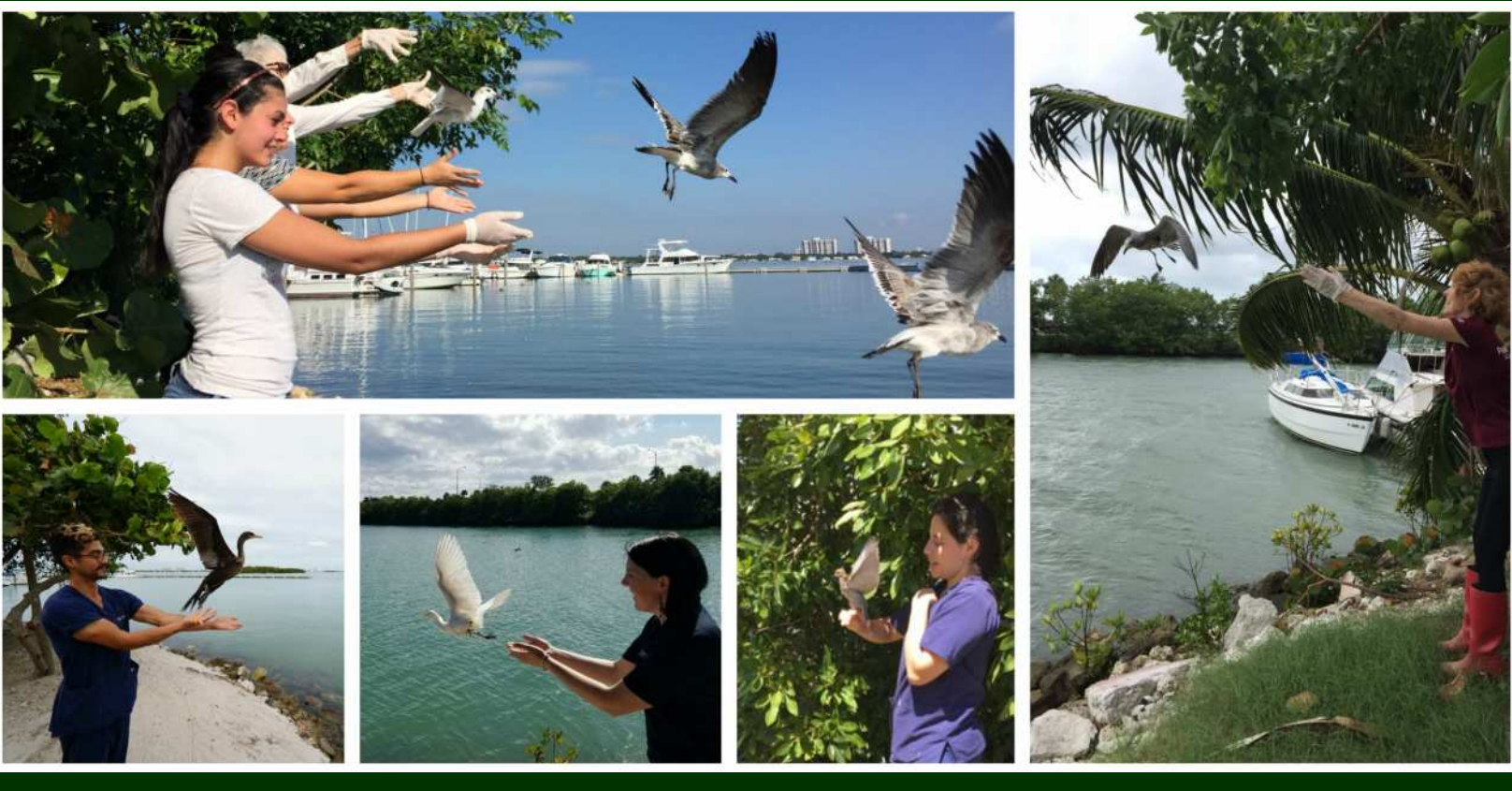
Release back into the wild - our ultimate goal