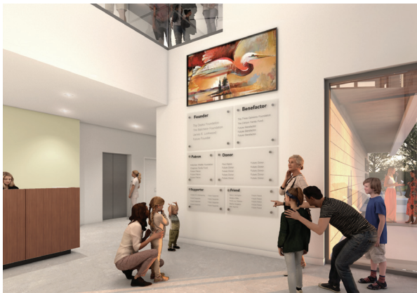
Donor Wall in Main Lobby