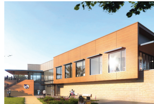
Wildlife Hospital & Education Center

Each sponsor will be recognized on the habitat or room that they sponsor.