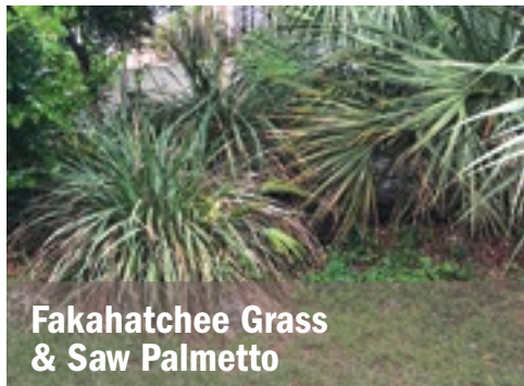
Fakahatchee Grass & Saw Palmetto